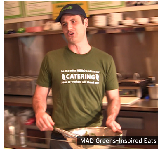
MAD Greens-Inspired Eats

HIRE's background checks help you build a dependable, trustworthy team.